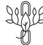
Greening Our Supply Chain