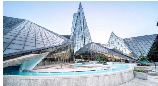
Principat d' Andorra